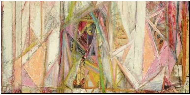
Martin Cohen, "Pink Bridge," 2009, mixed media on paper, 23 inches by 22 inches.